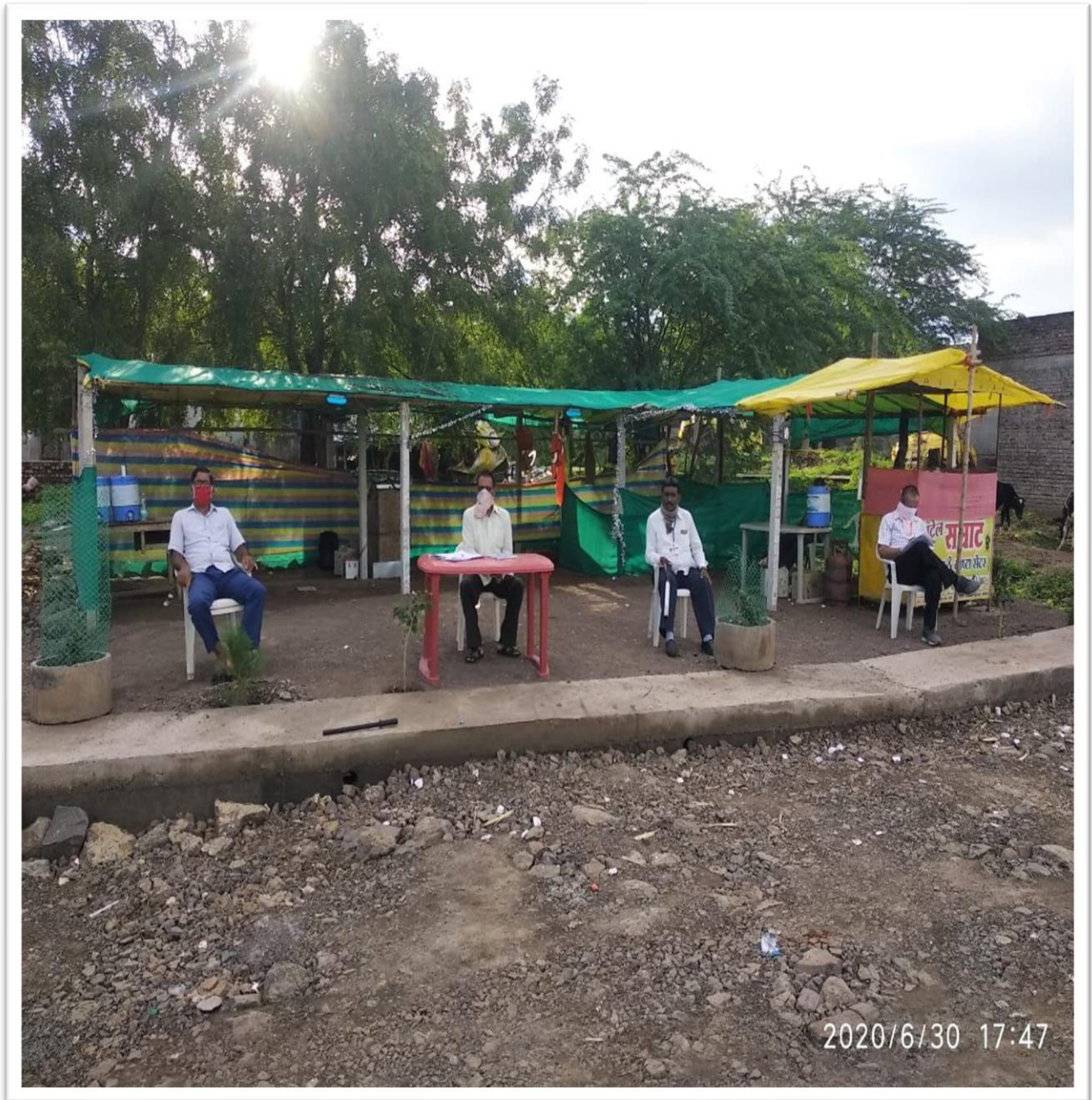
Corona Warrior during covid-19