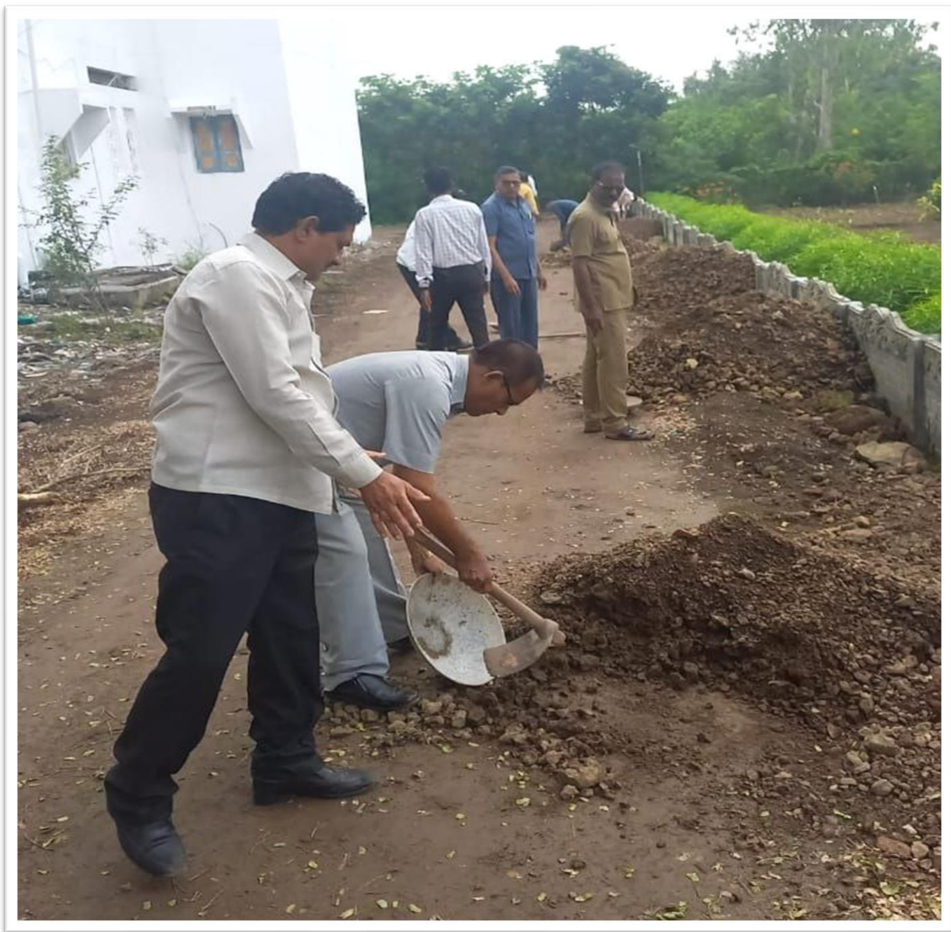
Social Cleaning Campaign