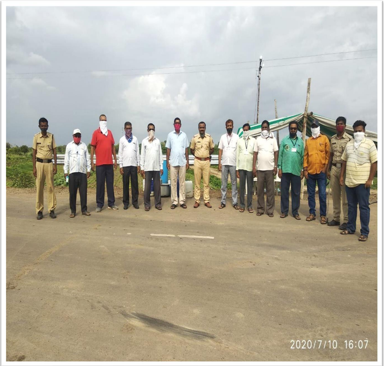
Corona Warrior during covid19